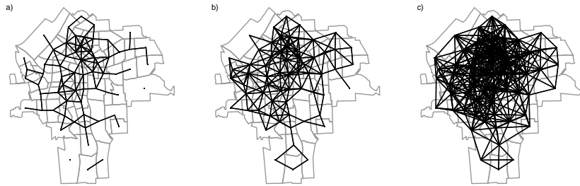
Figure 4: (a) Neighbours within 1,158 m; (b) neighbours within 1,545 m; (c) neighbours within 2,317 m

make .sym.nb function. The k = 1 object is also useful in finding the minimum distance at which all areas have a distance-based neighbour. Using the nbdist function, we can calculate a list of vectors of distances corresponding to the neighbour object, here for first nearest neighbours. The greatest value will be the minimum distance needed to make sure that all the areas are linked to at least one neighbour. The dnearneigh function is used to find neighbours with an interpoint distance, with arguments d1 and d2 setting the lower and upper distance bounds; it can also take a longlat argument to handle geographical coordinates.