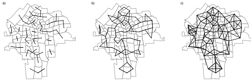
Figure 3: (a) k = 1 neighbours; (b) k = 2 neighbours; (c) k = 4 neighbours

representation of the spatial weights can become block-diagonal if observations are appropriately sorted.