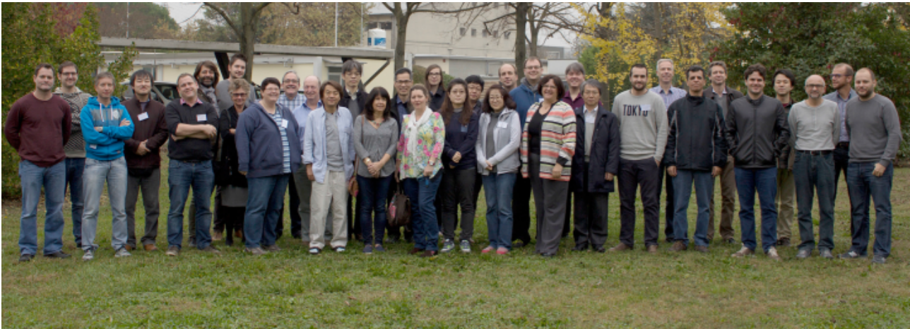
Figure 2: Example of a full-width figure showing the JACoW Team at their annual meeting in 2015. This figure has a multi-line caption that has to be justified rather than centered.

multiple affiliations, the secondary affiliation may be indicated with a superscript, as shown in the author listing of this paper. See ANNEX A for further examples.